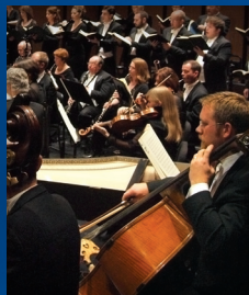
Music of the Baroque

Celebrating Arts and Ideas auartsandideas.com